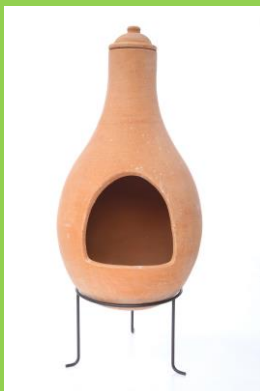
Large Fire Pot

Every Chiminea “Fire Pot” comes standard with the following: